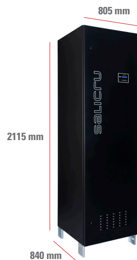
RE3 T 200/250-4