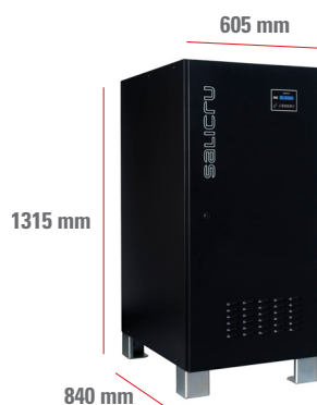
RE3 T 75-150-4